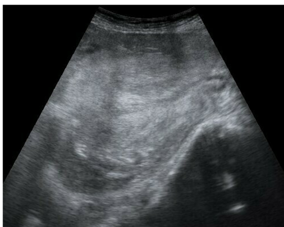
Fig. 1 Abdominal ultrasonography findings. The uterine fundus passes through the cervical ring (sagittal view: right side – patient's head, left side – patient's leg)

In addition, uterine necrosis may result from uterine atony. However, the time from uterine inversion to the development of necrosis is unknown. A previous study in the uteri of cynomolgus macaques showed that ischemia for 4 hours caused mild muscle degeneration and zonal degeneration. Periodical menstruation resumed in all animals with ischemia up to 4 hours, but animals with ischemia for 8 hours did not recover menstruation and