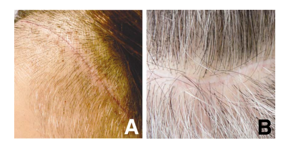
Fig. 2 Photographs of a fronto-temporal incision 2 weeks after the first operation (A) and coronal skin incision 8 months after the second operation (B) showing minimum wound scar and alopecia around the wound.